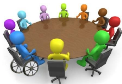
Thurrock Diversity Network